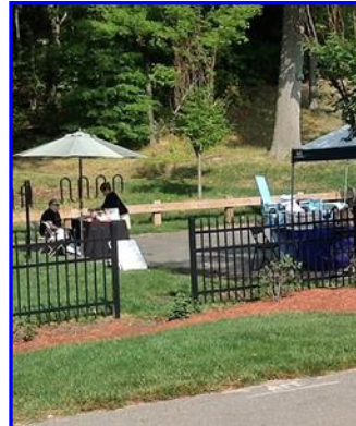
stART on the street September 17