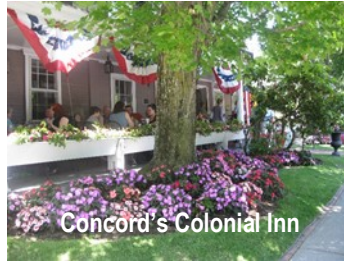
Concord's Colonial Inn

Saturday, June 25, was a beautiful day for a ride out to Concord for lunch at the Colonial Inn. Sixteen of us enjoyed getting to know each other.