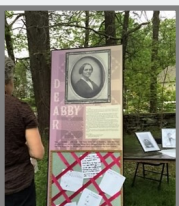
Letters to Abby