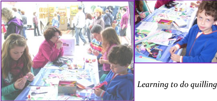
Learning to do quilling