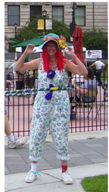
Cupcake the Clown

The first National Woman’s Rights Convention, in 1850 in Worcester, was significant for a number of reasons. It marked the beginning of the organized movement for women’s rights and called for the total reorganization of “all social, political, industrial interests and institutions.” The convention elected officers who were appointed to committees on education, civil and political rights, social relations, and avocations.